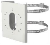
DS-1275ZJ-S-SUS Vertical Pole Mount