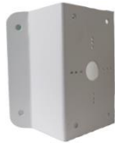
DS-1276ZJ-S-SUS Corner Mount

COMPLIANCE NOTICE: The thermal series products might be subject to export controls in various countries or regions, including without limitation, the United States, European Union, United Kingdom and/or other member countries of the Wassenaar Arrangement. Please consult your professional legal or compliance expert or local government authorities for any necessary export license requirements if you intend to transfer, export, re-export the thermal series products between different countries.